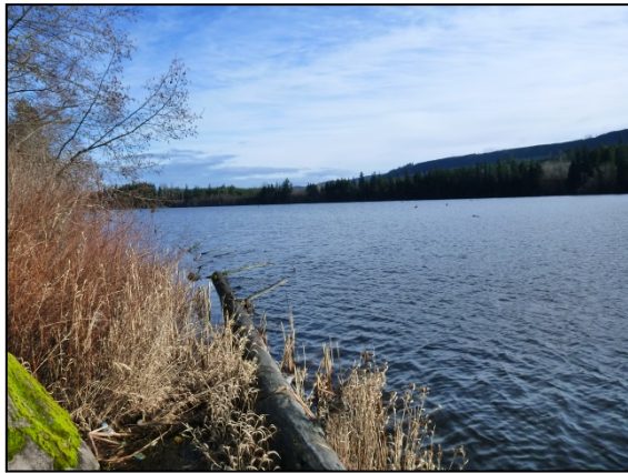
Lake Kapowsin

Lake Kapowsin is a 512-acre low elevation freshwater lake with mostly undeveloped natural shorelines. The lake's natural character is unusual in the Puget Sound lowlands, where most lakes have modified and developed shorelines. During the heyday of early logging in Washington, a booming town and lumber mills were along the western shoreline of the lake. In the 1920s, fires ravaged the town and mills, and in 1928 the city of Tacoma condemned property near the lake, anticipating the need for a new reservoir.