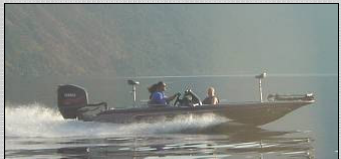
The Logstons in the Team Skeeter boat at Lake Pend O'Reille in Idaho