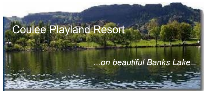
Coulee Playland Resort