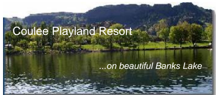
Coulee Playland Resort